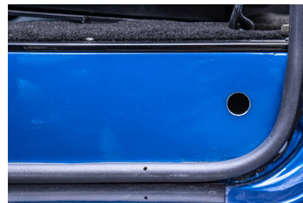
BODY SIDE HOLE