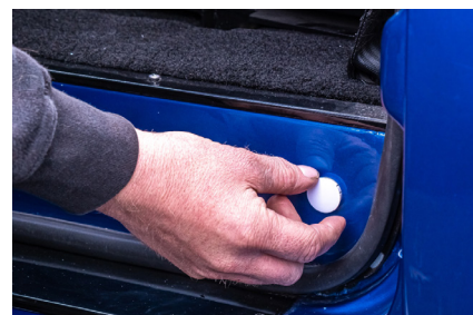
DOOR SIDE HOLE