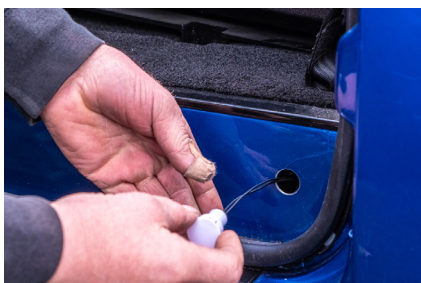
DOOR SIDE HOLE