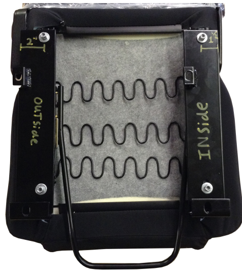
Underside Driver Seat Bottom