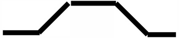
Stock Underside of Floor Board